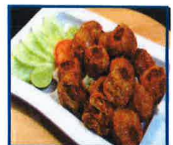
Shrimp Ball $12