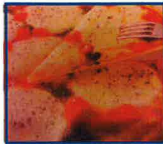
Mozzarella Pizza $15