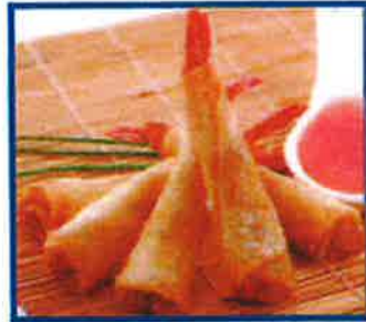
Thai Style Prawn Roll $5/4pcs