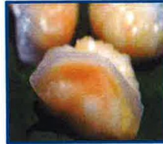
Steamed Scallop Har Kao $5/4pcs