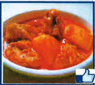
Signature Curry Chicken W/ Bread $10