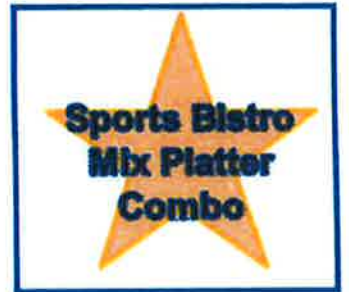
Mix Combo $18