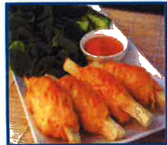
Sugar Cane Prawn $5/4pcs