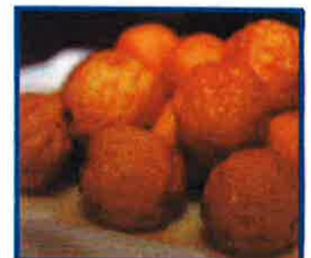
Sotong Balls w Fries $12