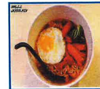
Instant Noodles With Sausage $8