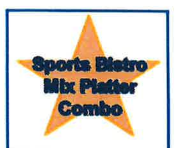
Mix Combo $18