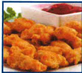
Tempura Chicken w Fries $12