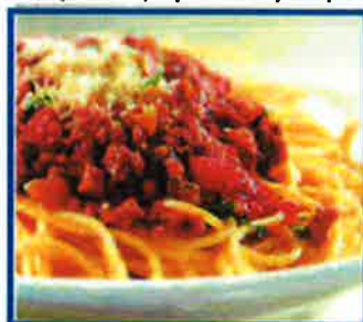
Spaghetti Beef Bolonaise $12