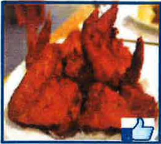
Sports Bistro's Specialty Chicken Wings w/ Fries $12