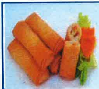
Golden Spring Roll $4/5pcs