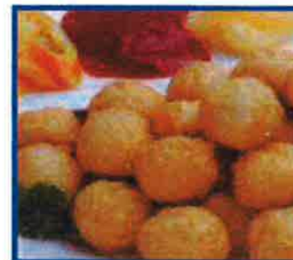
Tender Fish Balls $10