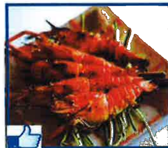
BBQ Prawn $12/ HALF DOZEN