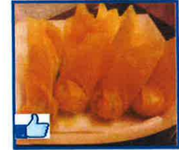
Super Crispy Butterfly Shrimp Wonton $12/12pcs