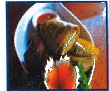
Thai Style Pandan Leaf Chicken $6/4pcs