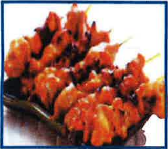
Grilled Smoky Teriyaki Chicken $12