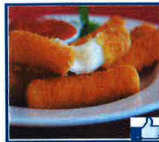
Cheese Stick $8/10pcs