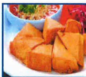
Authentic Fried Tau Kua W/Special Spicy Chilli Dips $7