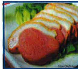
Teriyaki Smoked Duck $12