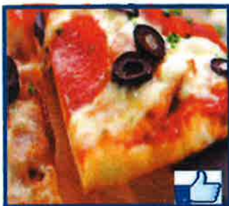
Pepperoni Pizza $15