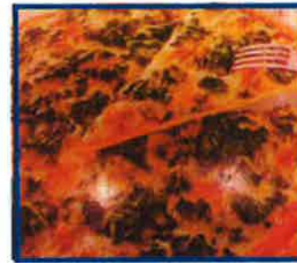
Spinach Pizza $15