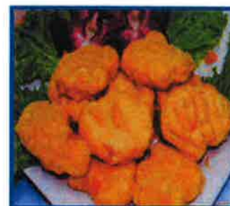
Chicken Nuggets w Fries $12