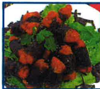
Seaweed Chicken w Fries $12