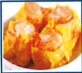
Steamed Chicken Siew Mai W/ Prawn $5/4pcs