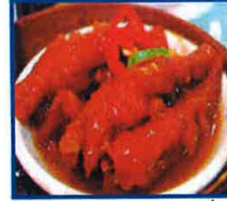
Marinated Chicken Feet $5