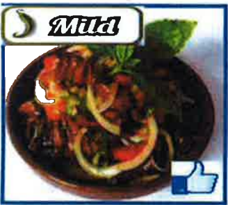
Asian Fusion Spicy Top Shells $12