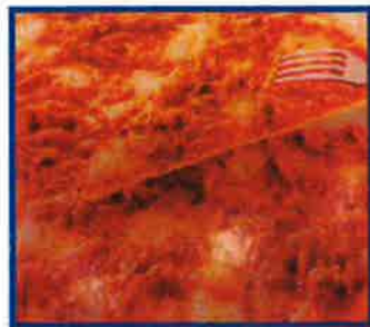
Tuna Pizza $15