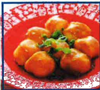
Curry Balls $12/ 10pcs