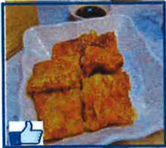
Sports Bistro's Specialty Beancurd Prawn $5/4pcs