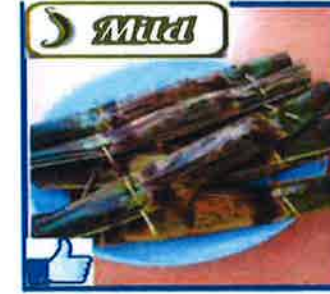
Fish Otah $12/10pcs