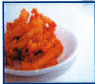
Calamari Finger $8