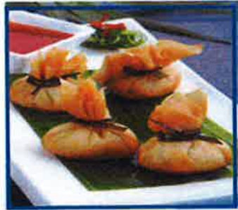
Mini Chicken Pocket $5/4pcs