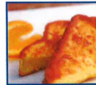
French Toast With Honey $8/ 3pcs