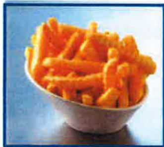
French Fries $8