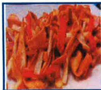
Crispy Shredded Crab Sticks $12