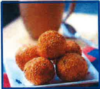
Sesame Peanut Ball $4/5pcs