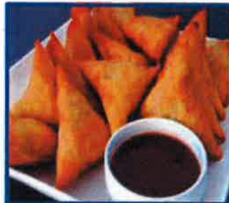
Potato Curry Samosa w Fries $8