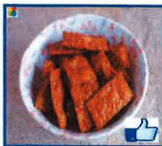
Crispy Vegetarian Goose W/Special Spicy Chilli Dips $10