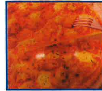
Mushroom Pizza $15