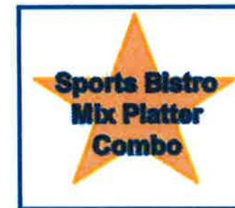
Mix Combo $18