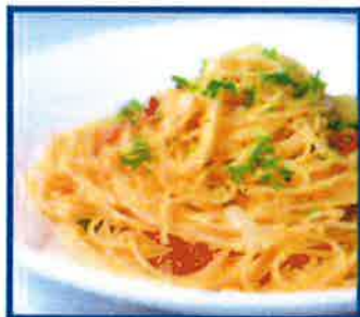
Seafood Carbonara $12