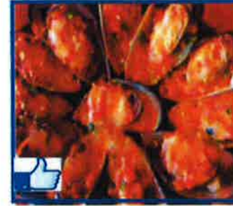
Baked Cheese Mussel $8/ HALF DOZEN