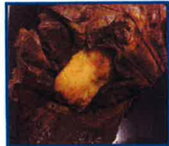
Lotus Leaf Gultionus Chicken Rice $5