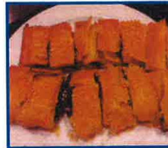
Red Bean Pan Cake $6