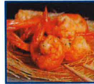
Prawn Bites $8/10pcs