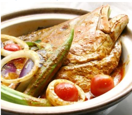
Curry Fish Head (Signature Dish)